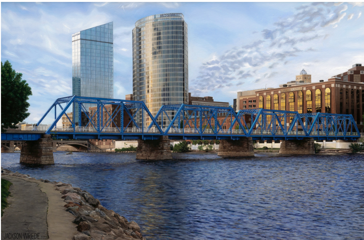
Southwest on the Grand River, 48" x 72"